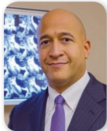
Westchester Spine & Brain Surgery 280 N Central Ave Hartsdale (914) 332-0396 wsbsonline.com